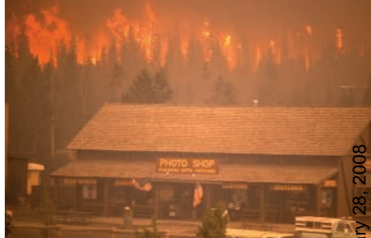
Too close for comfort. Wildfire is seen approaching Old Faithful Village, Yellowstone National Park, in 1988.

The fires in Yellowstone Park in 1988 (see the first figure) seemed to inaugurate this new era of major wildfires in the western United States. The fires lasted more than 3 months, burning 600,000 ha of forest, and-despite